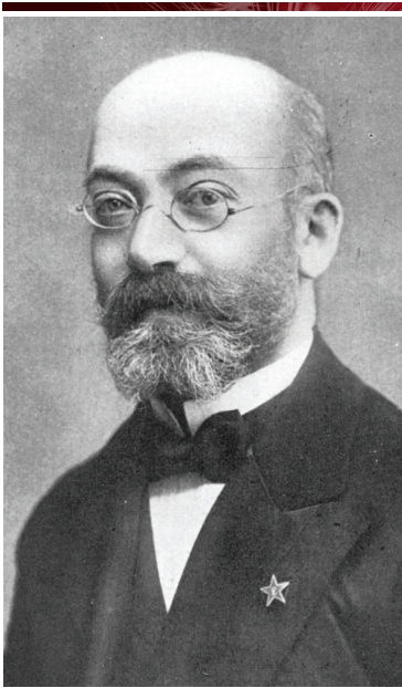
Ludwig Lazarus Zamenhof was a Polish doctor, linguist, and the creator of Esperanto, the most successful constructed language.

Finally, we come to Zamenhof Day, the most widely celebrated Esperanto holiday. For those who don't know (and a refresher for those that do), Esperanto is a constructed language with no ethnic genealogy. It was invented as a politically neutral, easy to learn, universal language.